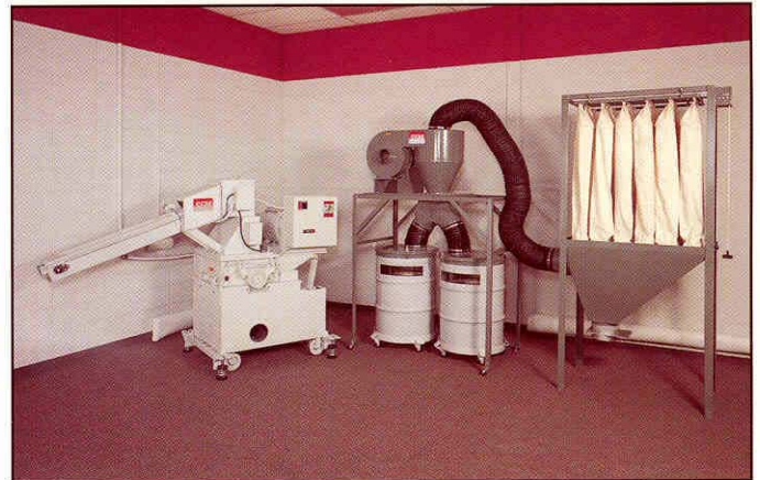
Pneumatic waste collector with dust filter